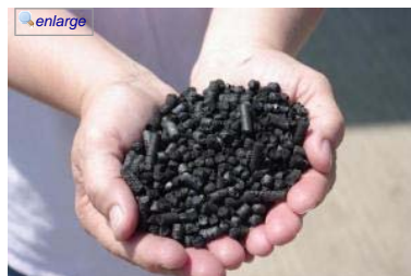
Biochar made from dairy manure pellets at the Department of Agriculture's Agricultural Research Station in Prosser, Wash.

With this information, they developed a mathematical model that could account for three possible scenarios. In one, the maximum possible amount of biochar was made by using all sustainably available biomass. Another scenario involved a minimal amount of biomass being converted into biochar, while the third offered a middle course. The maximum scenario required significant changes to the way the entire planet manages biomass, while the minimal scenario limited biochar production to using biomass residues and wastes that are